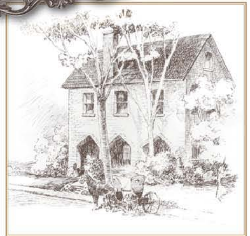
Saint Joseph's Infirmary, 1885